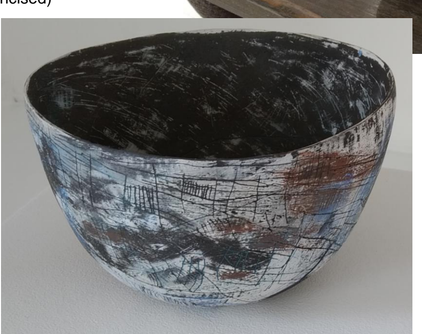
Porcelain vessel by Alistair Blair (Porcelain is difficult to work with, but rewards the effort with translucent vessels that show colours such as the painted panel with extra clarity.)

Sgraffito bowl by Kim Sacks (in stoneware clay, coloured and incised)