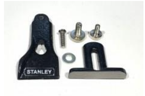
Kit 14 is the lever cap and depth stop: (1-12-713)