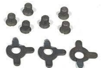
Kit 16 is the nicker spur kit with screws. (1-12-715)