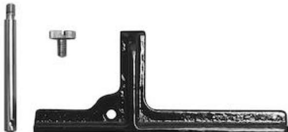
Kit 15 is the Fence and rod: (1-12-714)